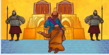
Book of Nehemiah