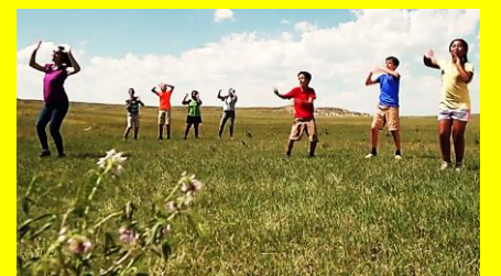
Good in Every Way