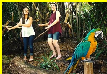
Trust in Jesus