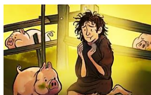
The Prodigal Son