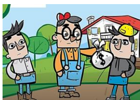
The Prodigal Son