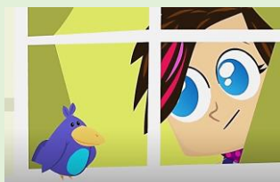
I Will Pray