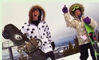
Pray About Everything