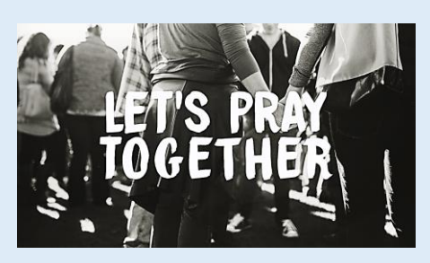
DEAR HEAVENLY FATHER: You have given your children the Armor of God. This armor protects us from the evil and lies of Satan. By the power of your Holy Spirit, give us a strong faith to shield us when Satan tries to create doubt in our minds and hearts about your love and promises. Keep us faithful in our use of the Means of Grace, the Word and Sacraments from which a strong faith comes. This week, make us bold and courageous soldiers for you. Use us to tell others about Jesus and how he has defeated sin, death, and the devil and given us a home in heaven. In Jesus' name we pray, Amen.