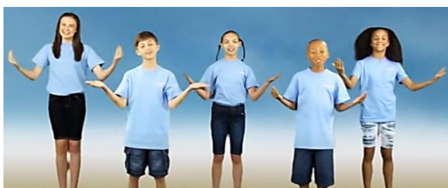
Sing the Prayer Together: Spirit of God

Spirit of God come and show me your way. Amen.