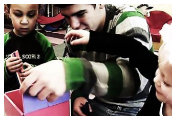
Ready to Serve