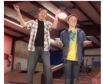
Living By the Spirit