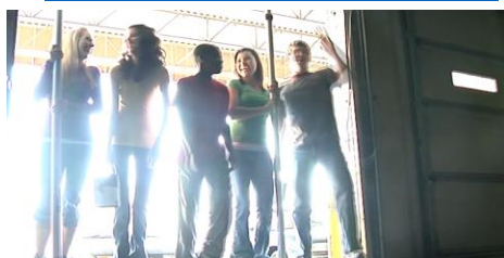
Living Inside Out