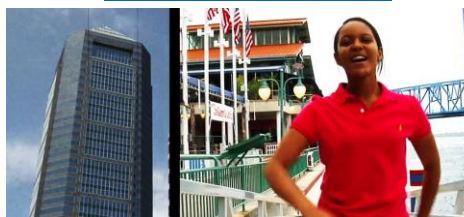
You Are, You Are the Messiah