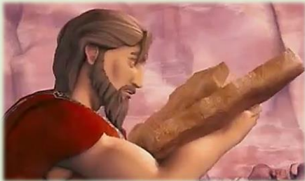
Ten Commandments to Moses