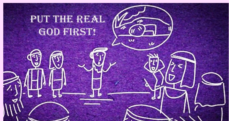
Paul Taught in Athens