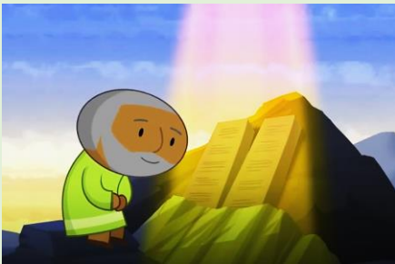
Ten Commandments/Golden Calf