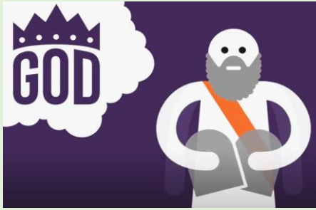
Ten Commandments-Faith Kids