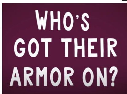
Armor Of God Song