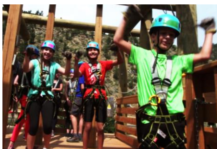
I Will Not Be Afraid