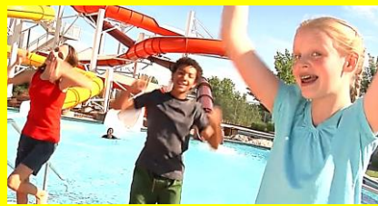
You, You, You