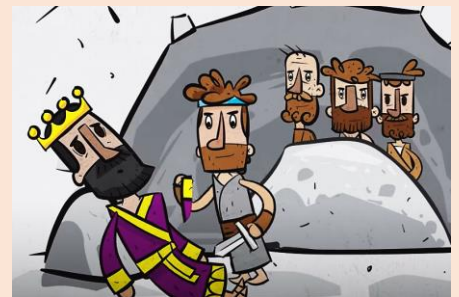
David and Saul