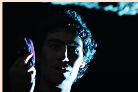
David Spares Saul's Life