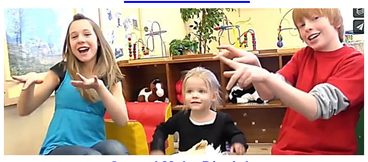
Go and Make Disciples