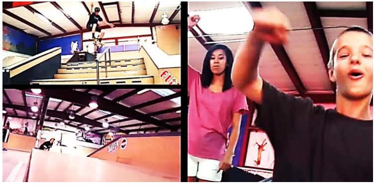
Only a Prayer Away