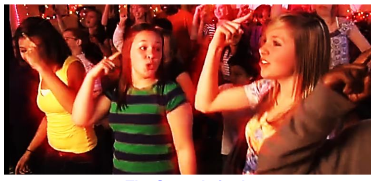
The Same Attitude