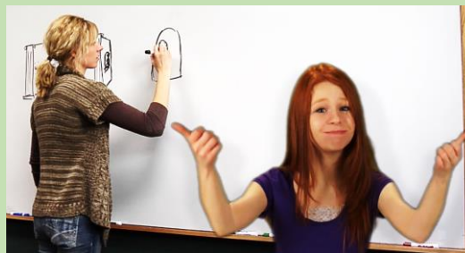
Caution: Open Window