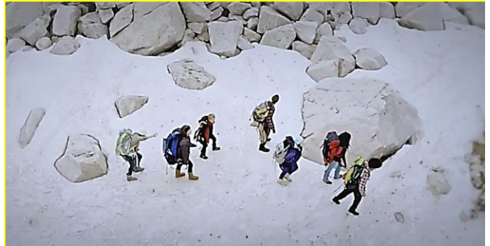
My God Is Powerful

Click on the hot links under each song, and sing!