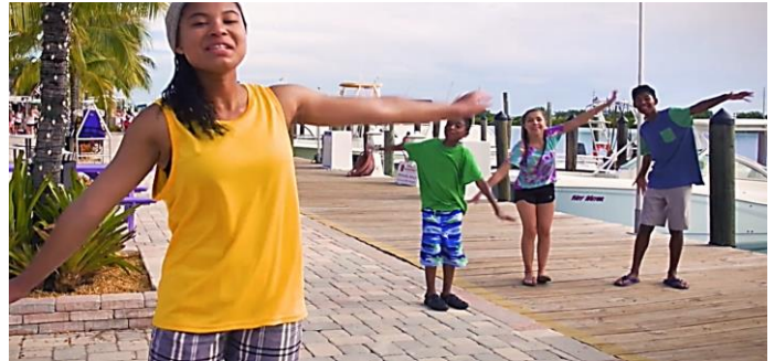
Won't Worry 'Bout a Thing