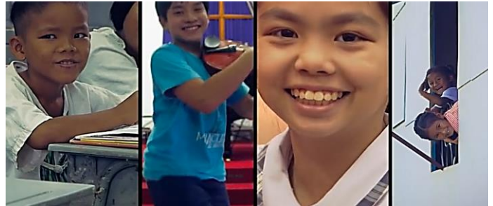
One True God