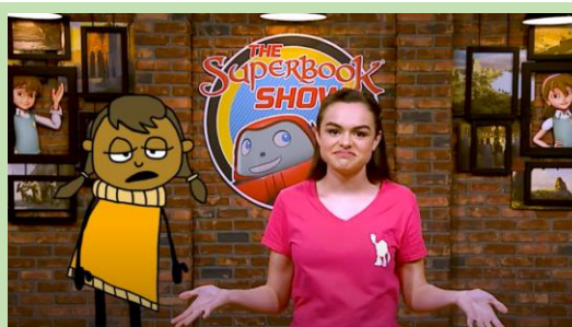
The Super Book Show